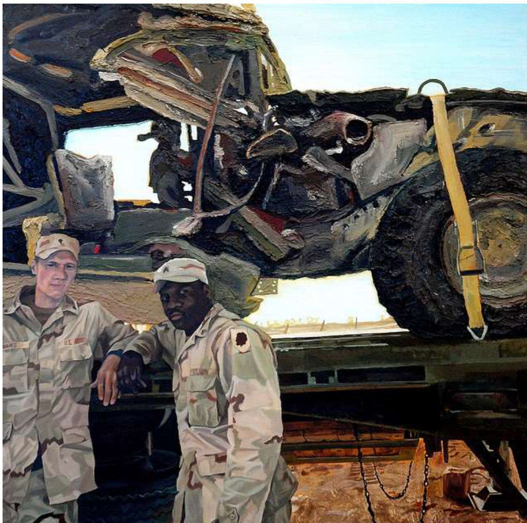
Oil on Panel (2006), 4 X 4 ft.